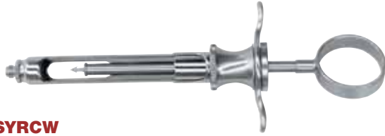
SYRCW Type CW Anesthetic Aspirating Syringe, Winged

Featuring carbide inserts, the needle holder is used to firmly hold the suture needle without damaging the needle edges.