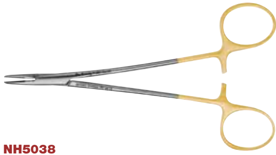
NH5038 Crile-Wood Needle Holder, 15cm/6"

Featuring carbide inserts, the needle holder is used to firmly hold the suture needle without damaging the needle edges.