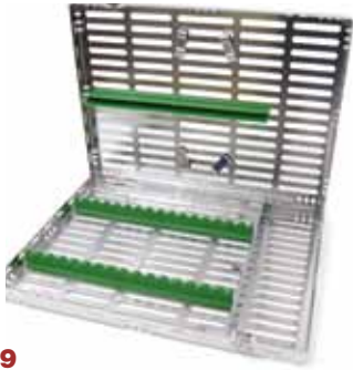
IMS-4169 Sig. Series Cassette (16), Green

Large Cassette for 16 Instruments plus additional space for accessories. Dimensions 8" x 11" x 1.25"