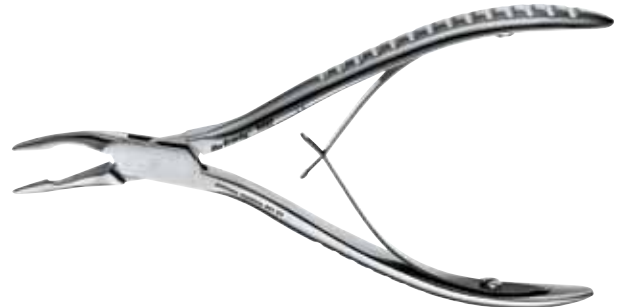
RMF Mini Friedman Ronguers

Used to handle surgical flaps delicately.