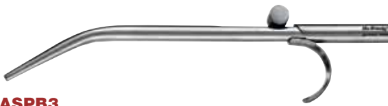
ASP B3 B3 Byrd Self-Cleaning Aspirator

Large Cassette for 16 Instruments plus additional space for accessories. Dimensions 8" x 11" x 1.25"