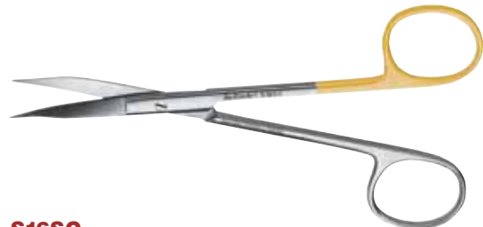
S16SC Goldman-Fox Super-Cut Scissors, 12.5cm/5"

Used for the removal of granulated tissue, harvest tuberosity bone and removing bony spicules.